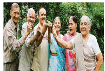
Atal Vayo Abhyudaya Yojana 2023

(A) Atal Vayo Abhyudaya Yojana is a comprehensive initiative aimed at empowering senior citizens in India. It was introduced by the Ministry of Social Justice and Empowerment. The scheme recognizes the invaluable contribution made by the elderly to the society and seeks to ensure their well-being and social inclusion.